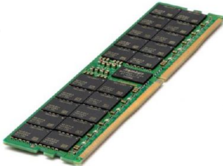
HPE DDR5 SmartMemory

As workloads grow and data center trends such as server virtualization, cloud computing, and the use of large database applications increase the need for higher-capacity memory with greater uptime, the quality and reliability of DRAM become ever more important. HPE SmartMemory goes through additional rigorous qualification and testing processes that unlock extended memory performance features available only with HPE Gen11 servers. This extensive testing ensures that HPE server memory is completely compatible with and optimized for HPE servers.