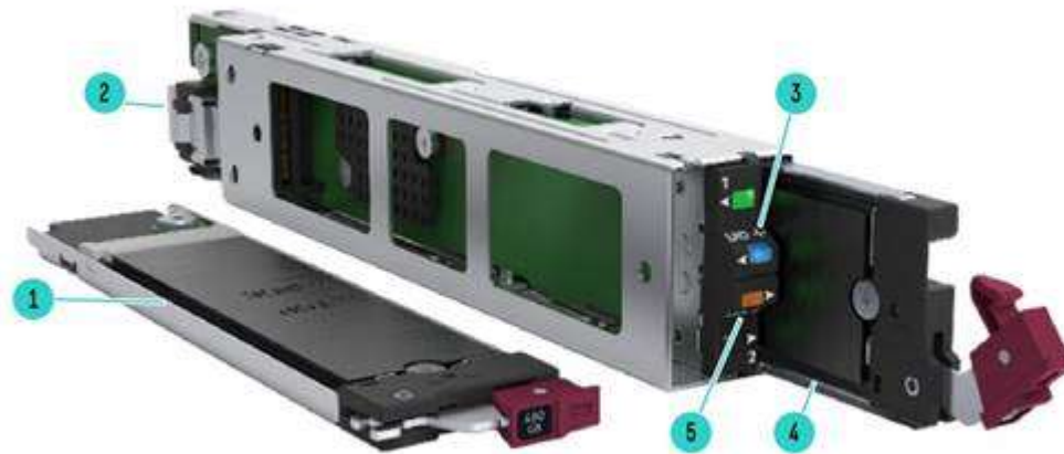
HPE NS204i-u Gen11 Boot Device