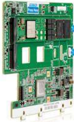
NS204i-d (Synergy 480 Gen10 Plus Compute)